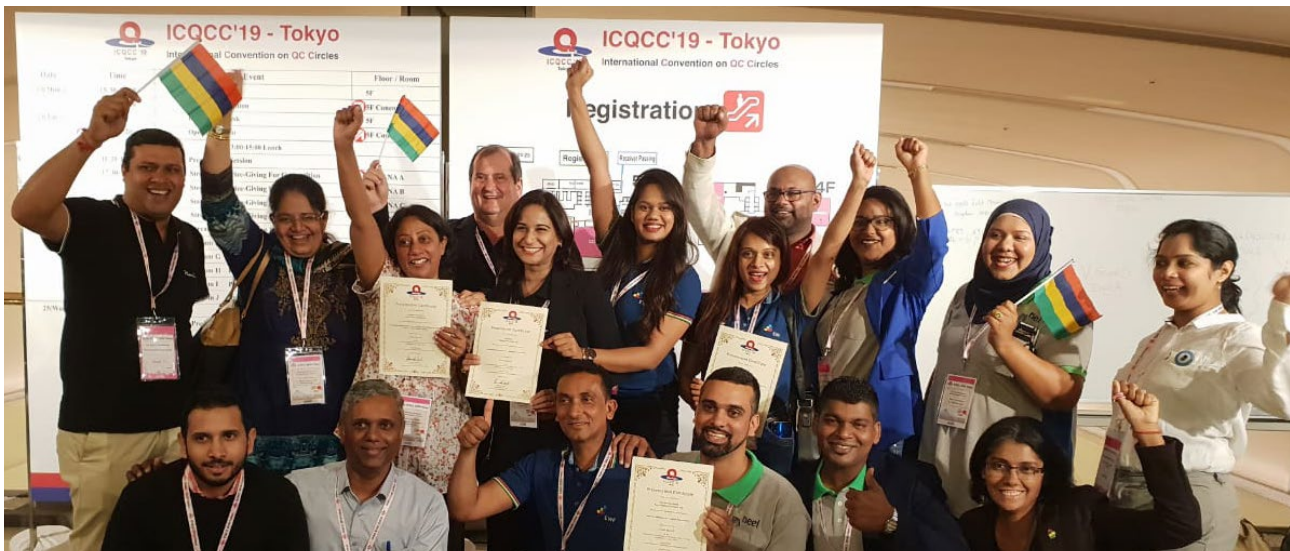
Les représentants des équipes mauriciennes à l'ICQCC 2019 à Tokyo, Japon.

Les six équipes mauriciennes membres de la délégation menée par le NPCC à participer à l'International Convention on Quality Control Circles (ICQCC) 2019 ont livré une brillante performance à cet événement mondial qui a vu la participation de centaines d'organisations de 14 pays.