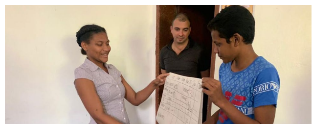
One of the teams displaying their works to the class.