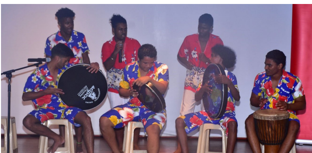
The team from Sebastopol SSS performing a song on the impact of drugs on youth