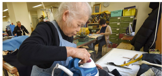
An ageing workforce represents many challenges for developing countries like Mauritius.

A rapidly ageing population implies that there would be fewer working-age people in the economy, leading to a mismatch between demand and supply of required talent to fill in necessary positions.