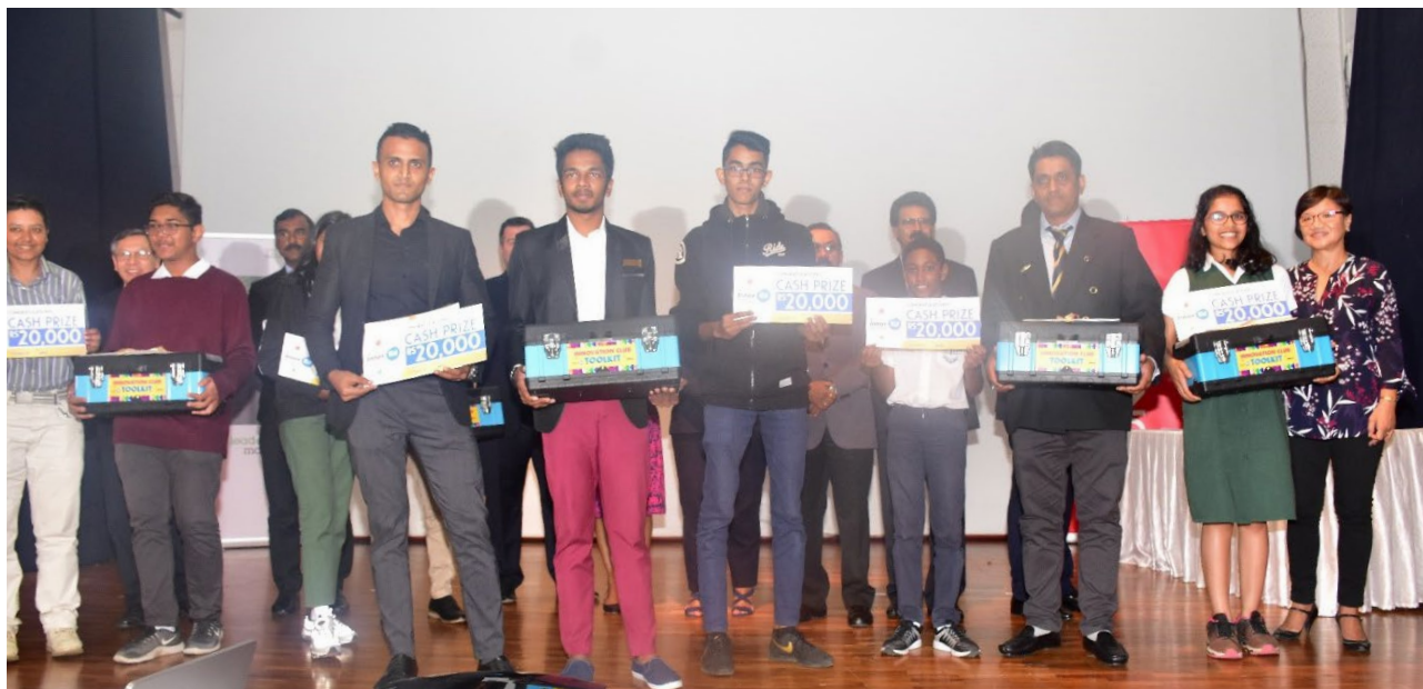
The winners of InnovEd 2019