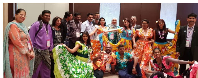
Les membres des équipes ont défilé au couleurs mauriciennes à l'ICQCC 2019.