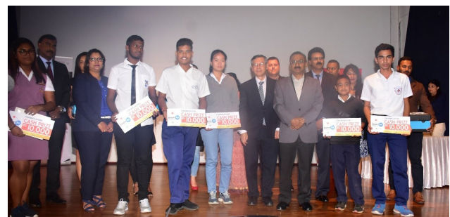
The runner ups of InnovED 2019: Ebène SSS Girs!, Sir Abdoool Razack Mohamed SSS, Prof Hassan Raffa SSS, Piton State College and MGI Secondary School

InnovEd targets all secondary schools and MITD Centers in Mauritius and Rodrigues.