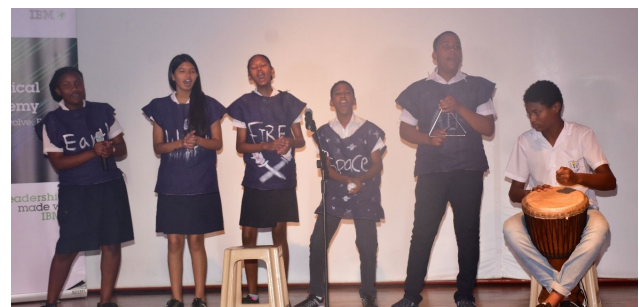
The team from Ideal College performing a song on the five elements of nature