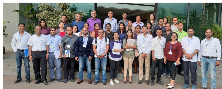
The participants of the SCORE programme

Since inception, SCORE Training, an initiative of the ILO, has been delivered to over 2100 SME's globally. This represents a total workforce of over 403,000 workers who have benefited from enterprise improvements, including efforts to develop a culture of respect, trust and communication in the workplace. SCORE Training has improved productivity up to 50% in participating SMEs and boasts an 91% satisfaction rate.