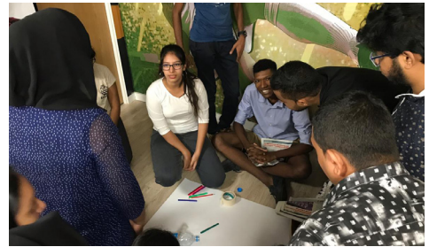
Port Louis Youth Centre