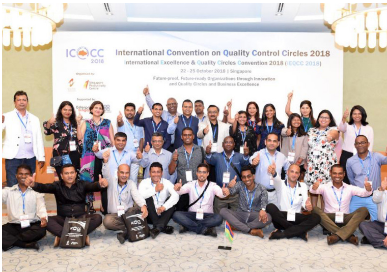
The Mauritian Team awarded for the ICQCC 2018 in Singapore