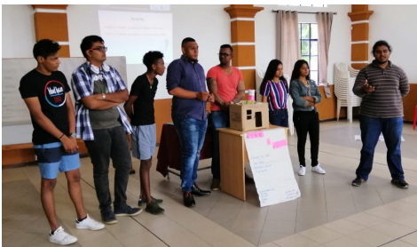
Montagne Blanche Youth Centre