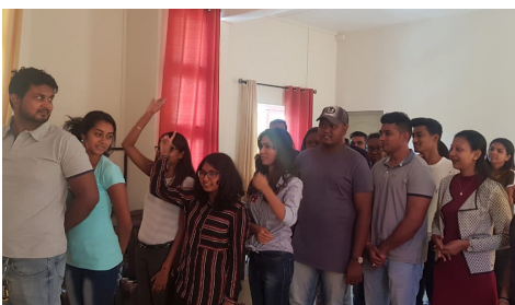
Pamplémousses Youth Centre