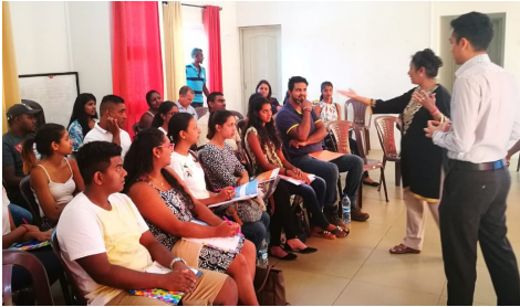
Bambous Youth Centre

“Leadership is a subject that has always attracted me. This project comes at an opportune time when we really need leaders at all levels to transform our country into a high income nation in the years to come.”