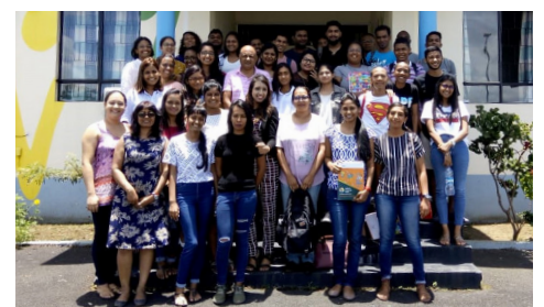
Floreal Youth Centre