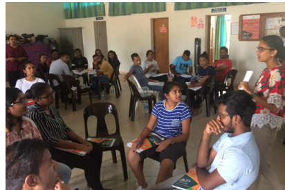
Flacq Youth Centre

During the course, the participants will be given the opportunity to discover their leadership skills and develop their talents.