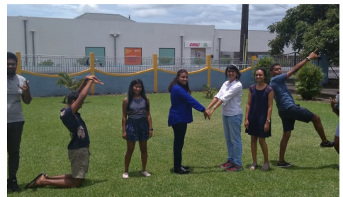
Rose Belle Youth Centre