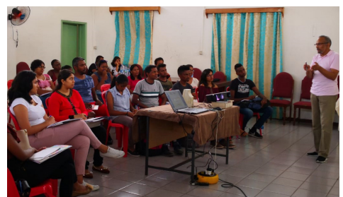
Trèfles Youth Centre