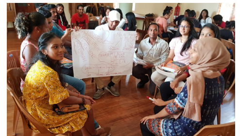
Rivière du Rempart Youth Centre