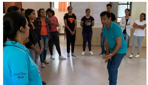
Souillac Youth Centre