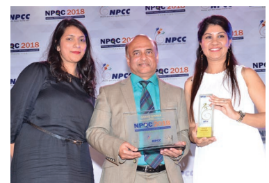
Haemophilia Association of Mauritius