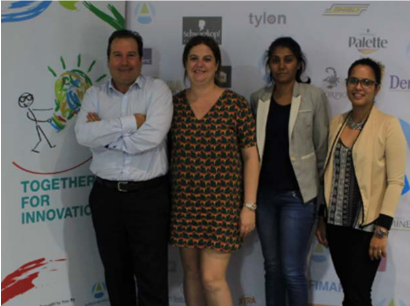
The Archemics team set up the 'Together for Innovation' programme with the assistance of the NPCC.

With the help of the NPCC, Archemics, specialized in the production of household, industrial detergents, cosmetics, industrial and adhesives, textile auxiliaries, had embarked on an Innovation and Quality Circle (IQC) programme in February 2017, which ended in July with the Innovation Awards, confronting seven projects.