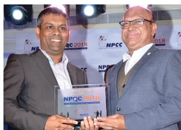
Central Electricity Board