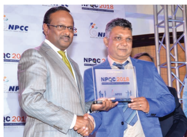
Kanhye Health Foods Co Ltd