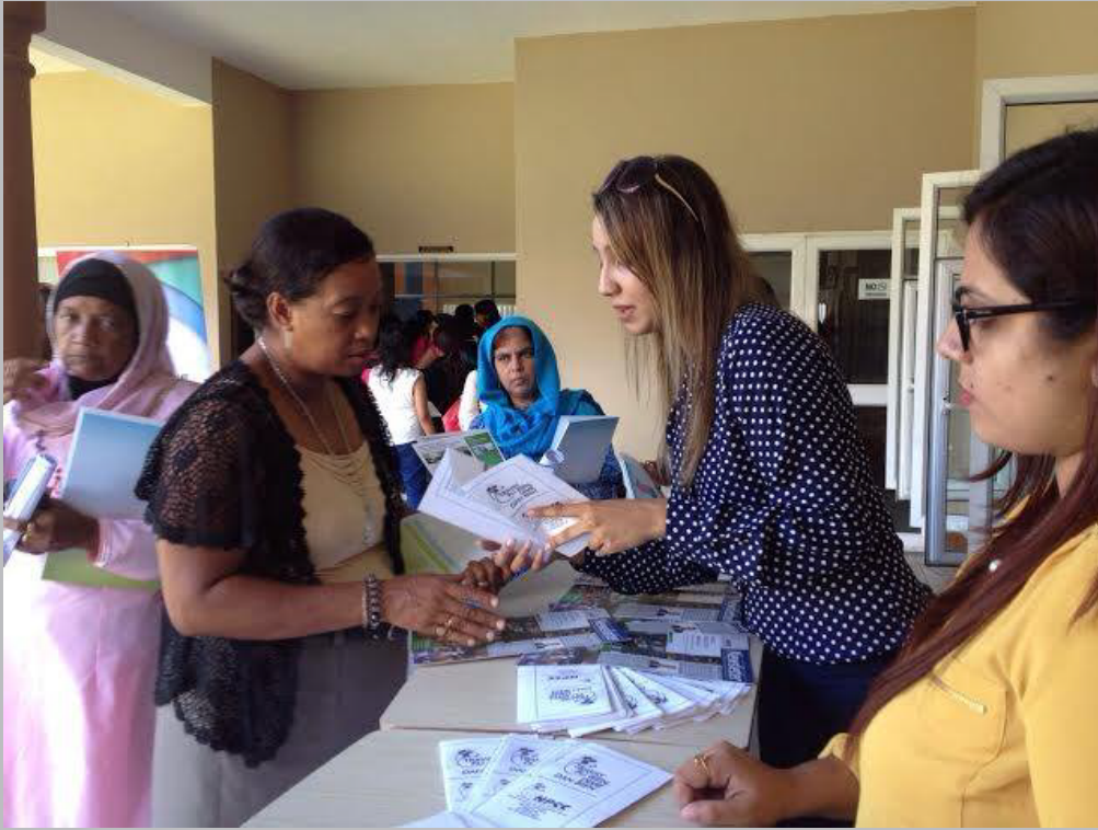
In line with its efforts to promote a productivity culture among women entrepreneurs, the National Productivity and Competitiveness Council participated in an open day at the National Women Entrepreneur Council Phoenix(NWEC).